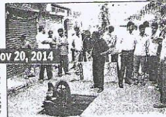
Pimple Saudagar Resident Suffers Head Injuries, Son Safe; Grille Cover Stolen

It is for the second time that heavy machinery was brought into the area and the same section of the road was dug up to 15 feet. It is a gaping